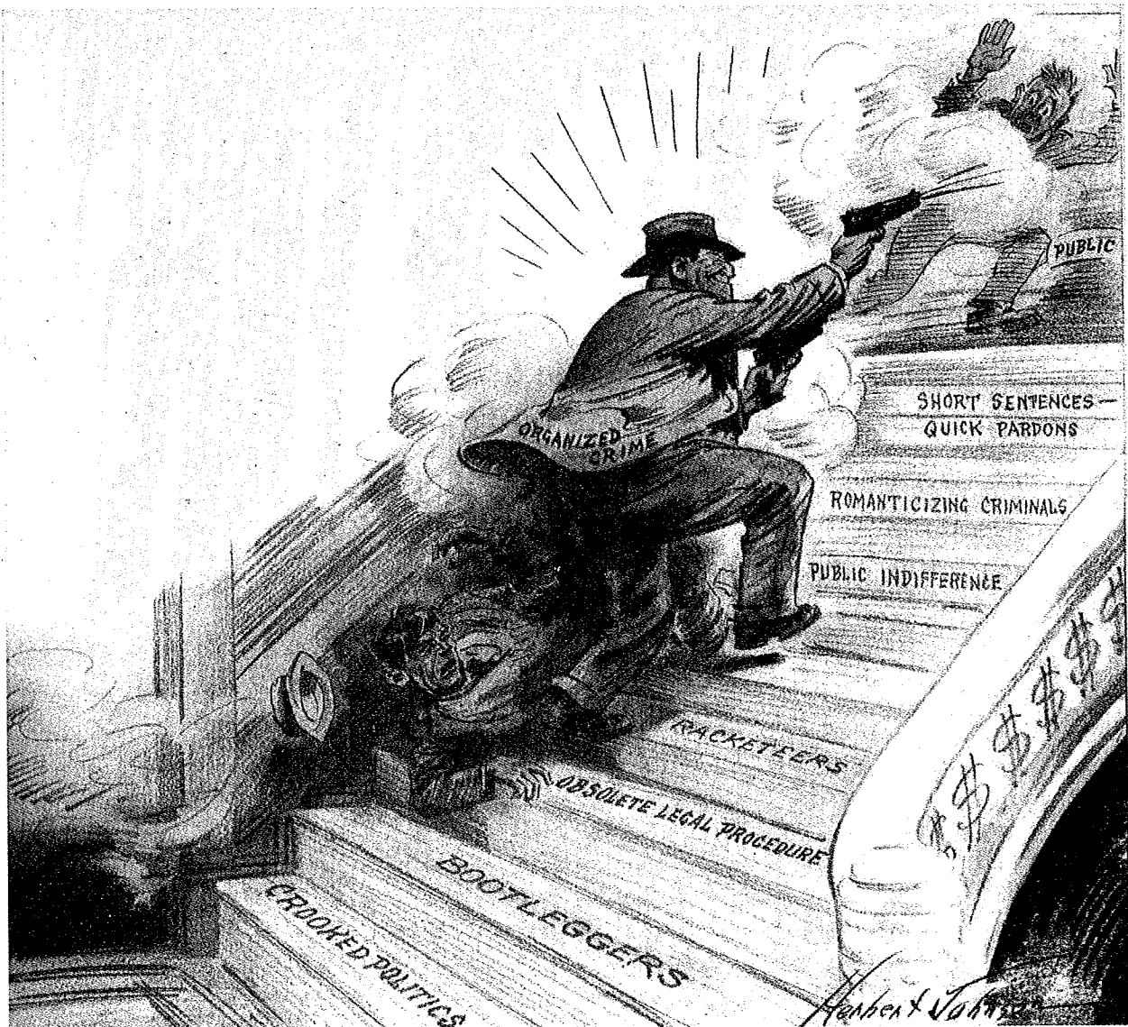
The Heritage of Prohibition, Herbert Johnson.

The hotly debated 18th Amendment, which prohibited the manufacture, sale, and transportation of alcoholic beverages, went into effect in January 1920. According to this political cartoon, what was the impact of prohibition?